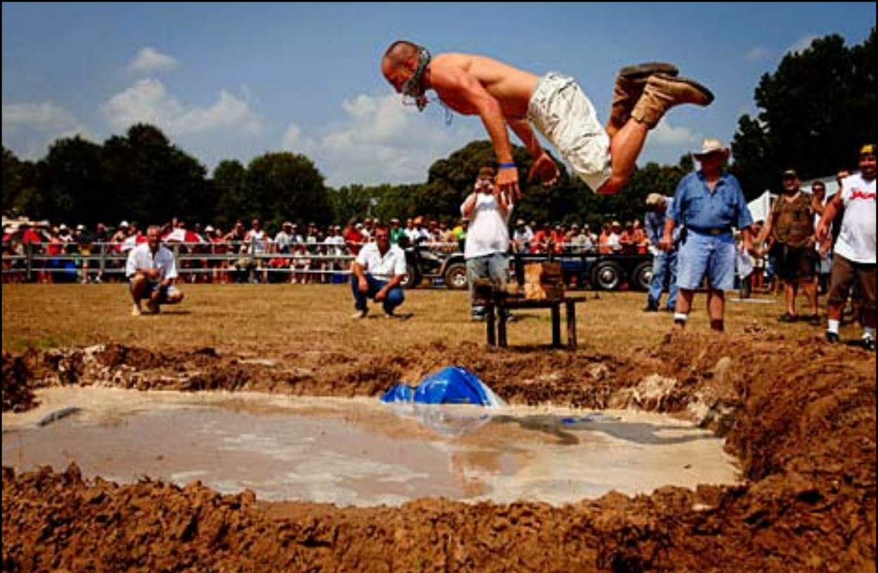
Redneck Olympic diving ...