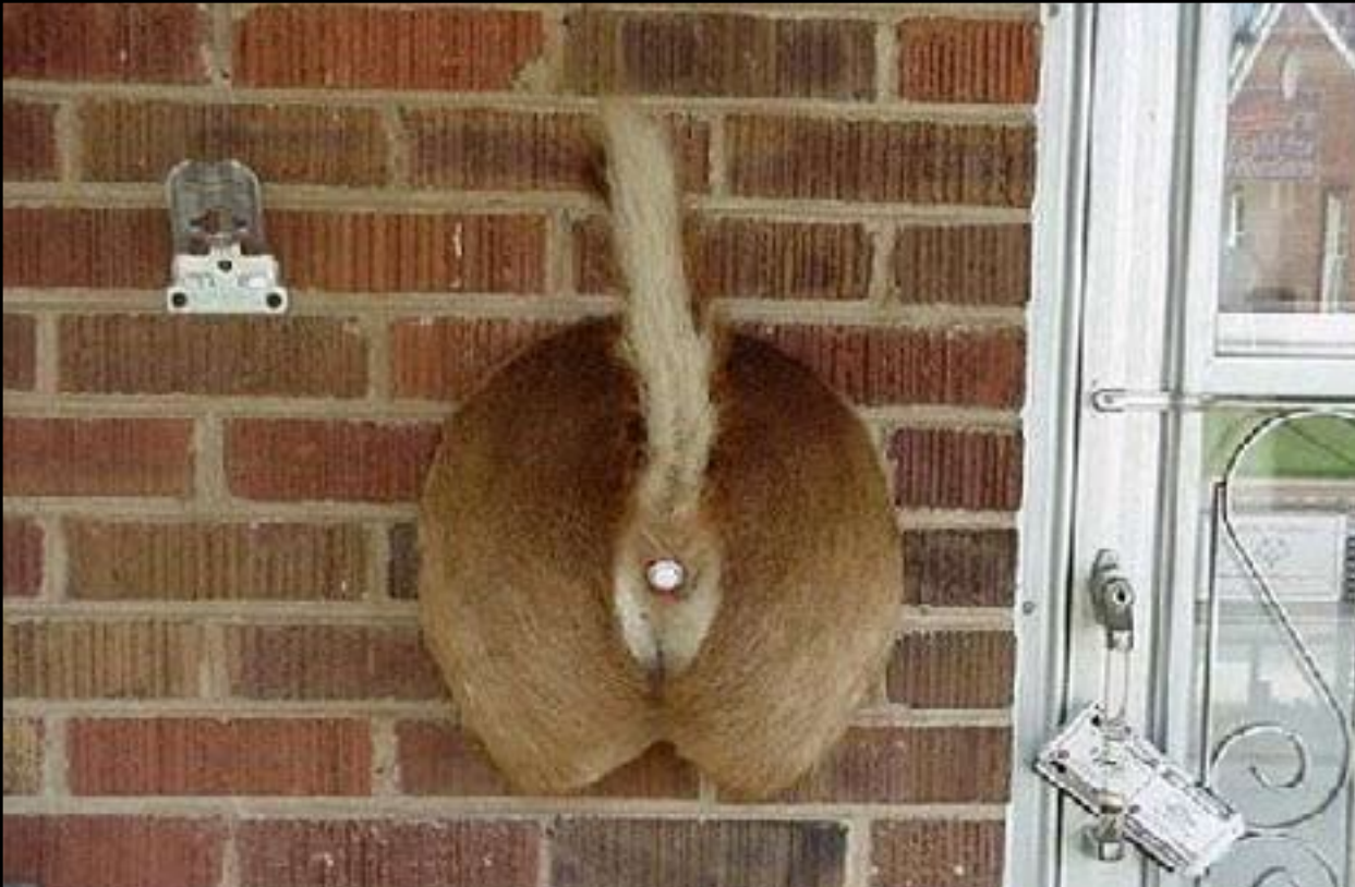
A redneck doorbell...