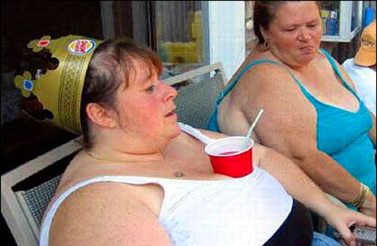
Redneck cup holder...