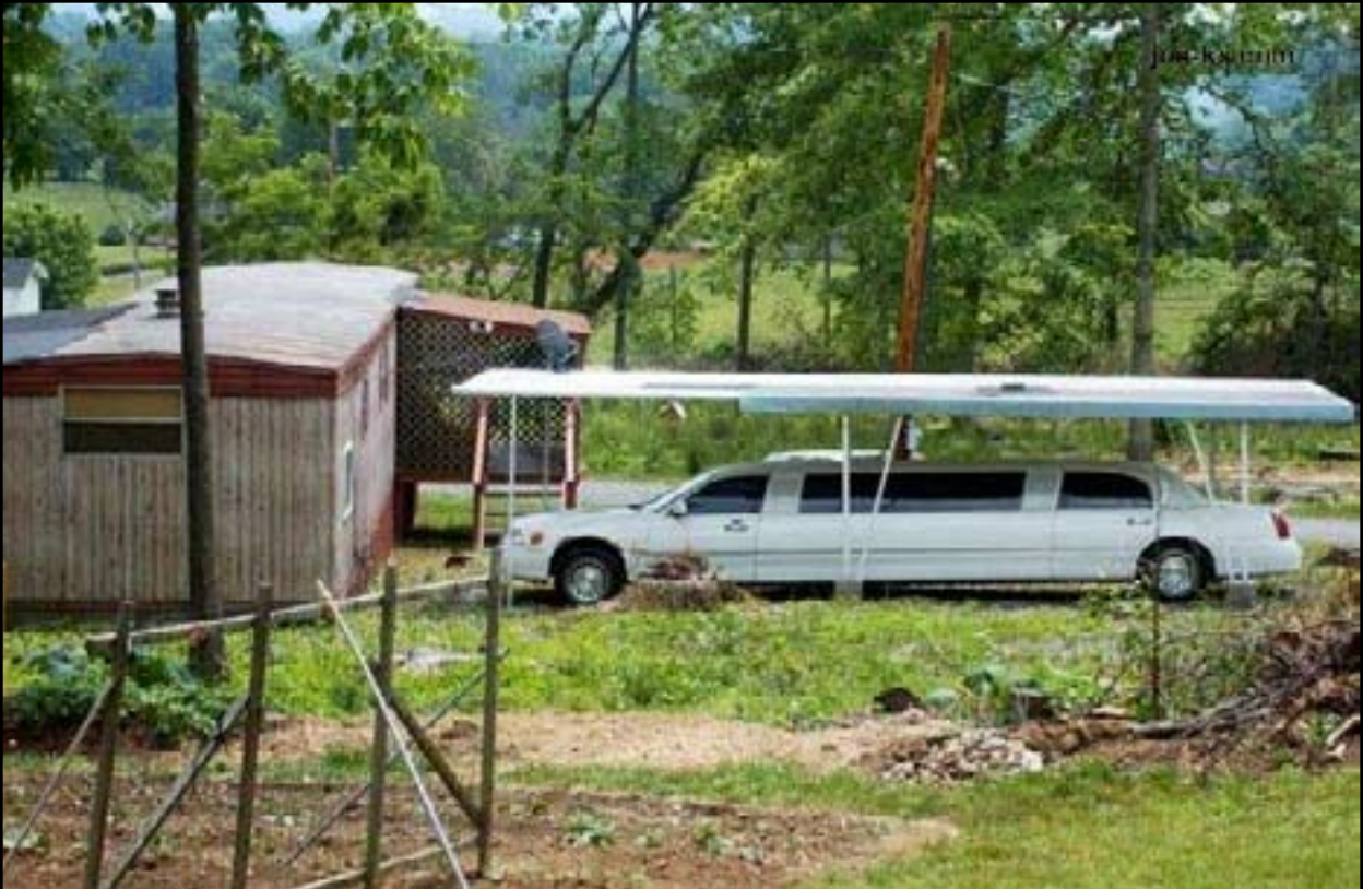
When a Redneck hits the lotto...