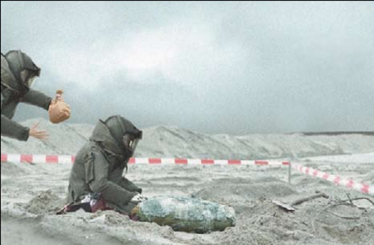
Redneck humor on the bomb squad ...