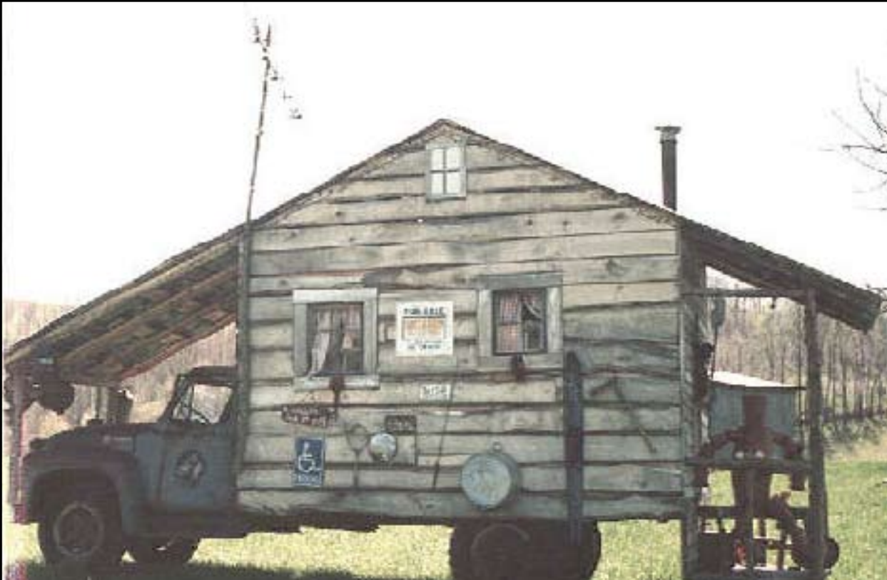
Redneck "Recreational Vehicle" ..