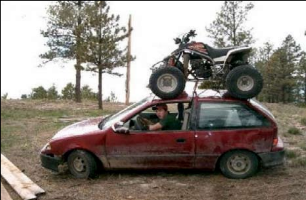
Redneck ATV trailer...