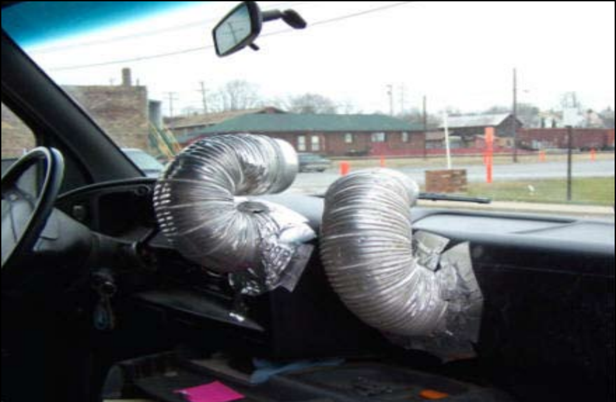
Redneck window defrosters...