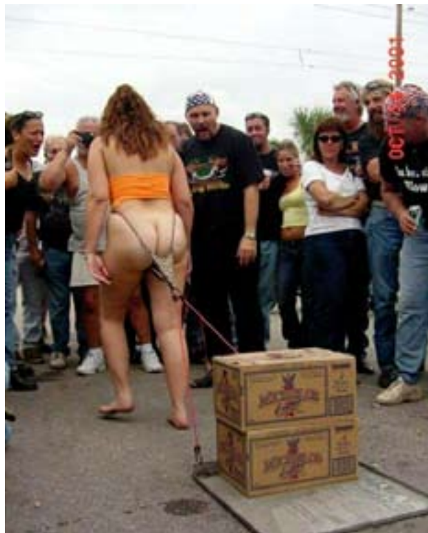
Redneck Tractor Pull....