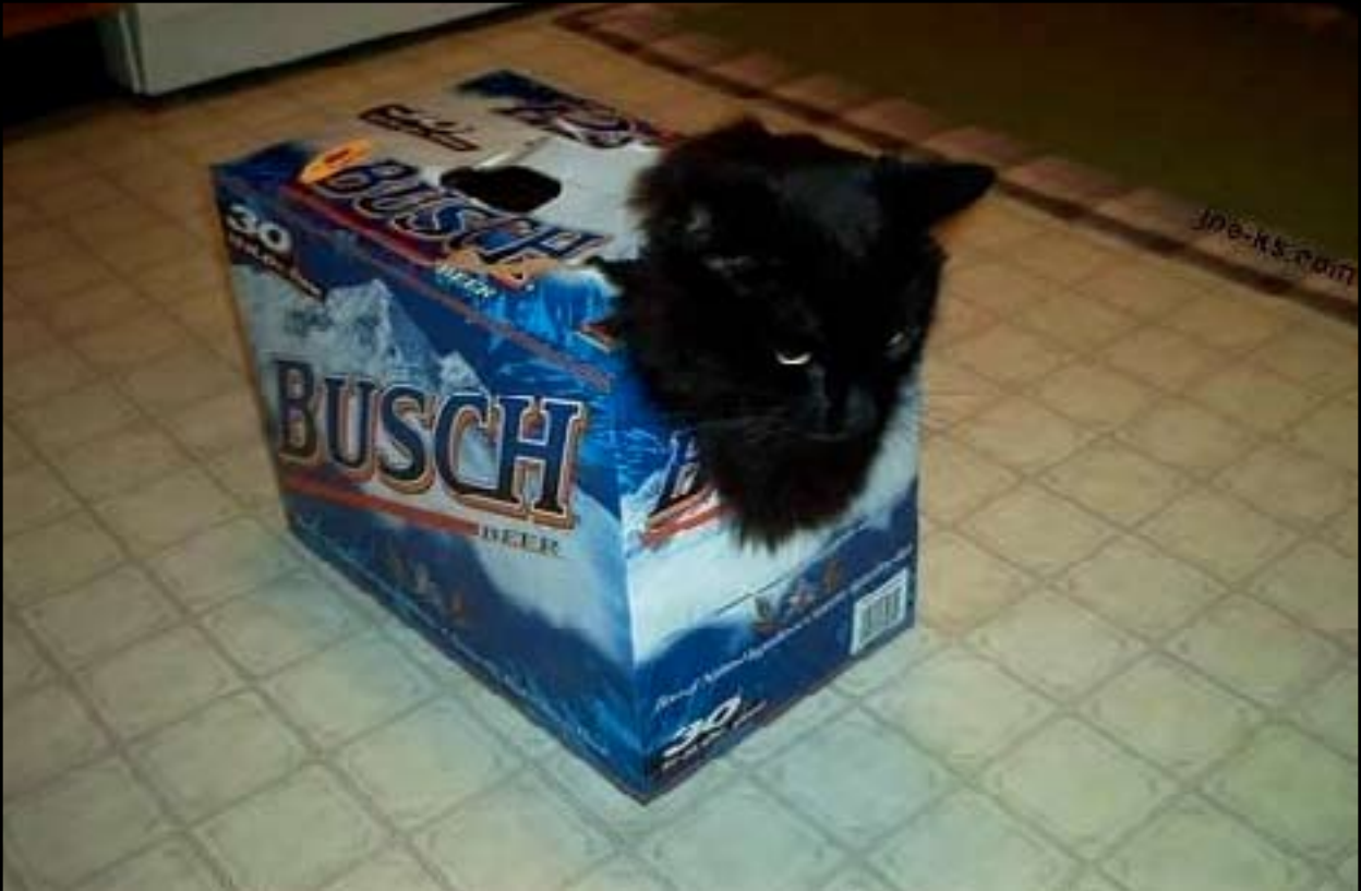
Redneck's invented the "Pet Carrier"...