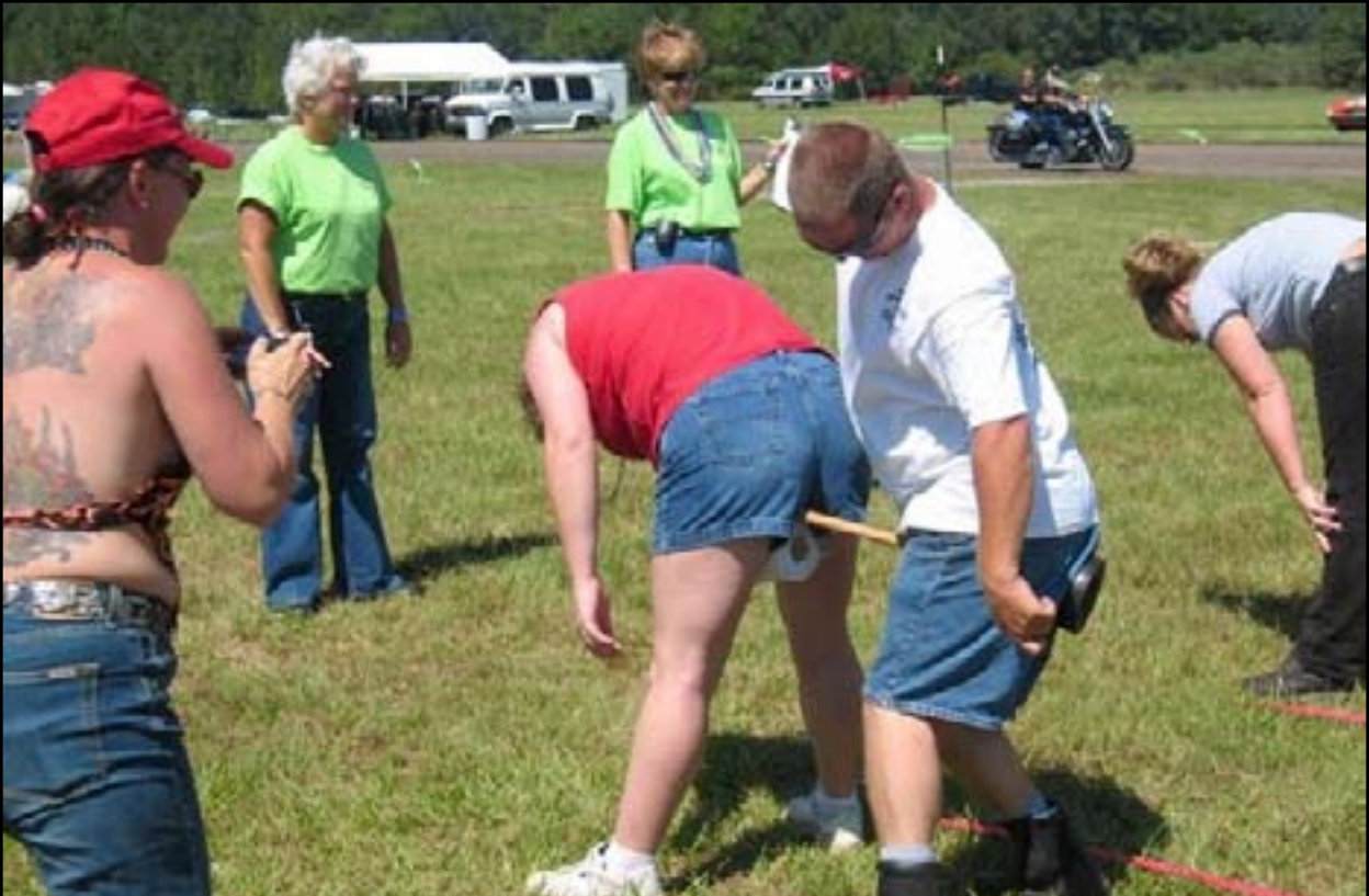
Redneck sex education class ...