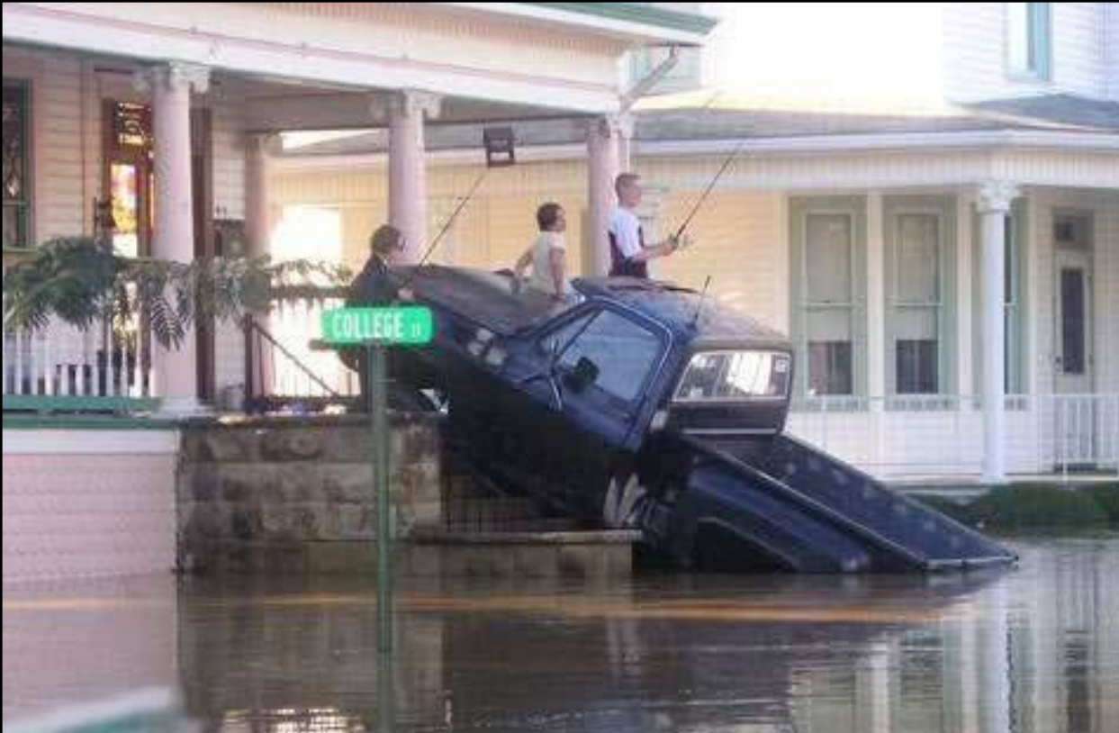
Redneck Fishin' ...