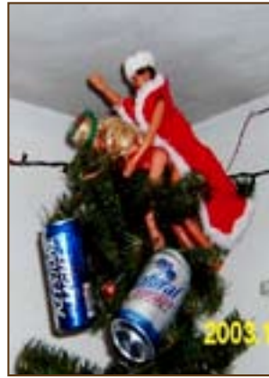
Christmas trees... Redneck style!