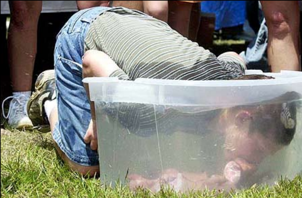
A Redneck twist on the traditional "Bobbing for apples" kids game ...