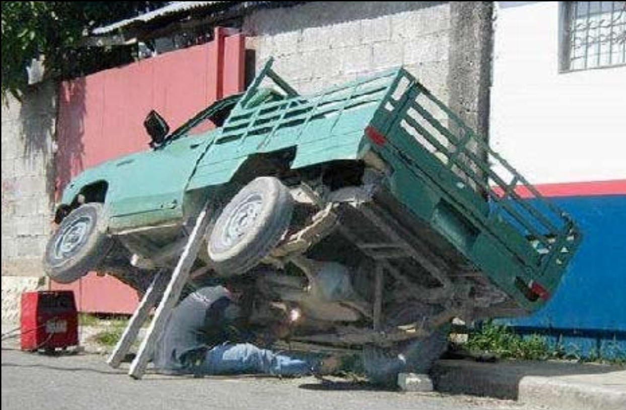
The local redneck mechanic...